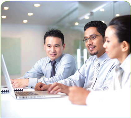
Large Business Loan