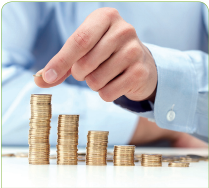
Micro and Small Business Loan